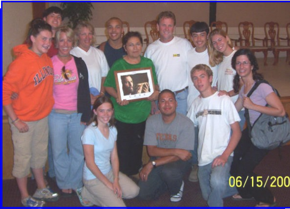
CCC's 2005 Mexico Mission Team