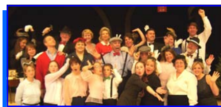
40th Birthday Party